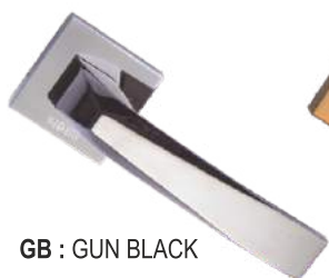
GB : GUN BLACK