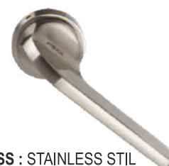
SS : STAINLESS STIL

FEATURE OF HANDLE : Handles are made from high grade materials using advanced matching and finishing process Suitable for main door and internal door