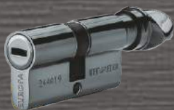
GB : GUN BLACK