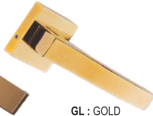
GL : GOLD