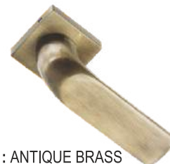
AB : ANTIQUE BRASS