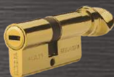
GL : GOLD