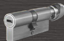
SS : STAINLESS STEEL