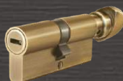
AB : ANTIQUE BRASS