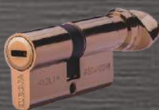
RG : ROSE GOLD