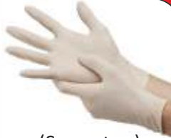
Hand gloves (Spare too)